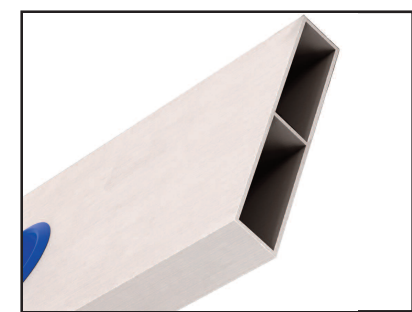
"H" style reinforcement for durability