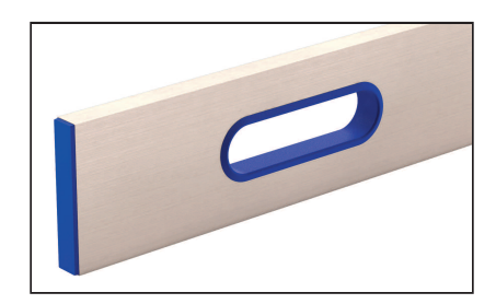
Dual handle grips and capped ends