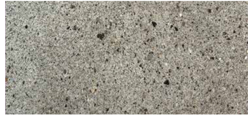
Violet #03 Acid Etch (#32-566)