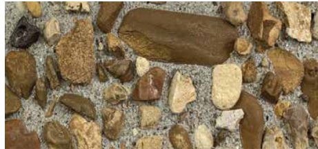
Pink #125 3/8" to 5/8" Aggregate (#32-571)

With BonWay Decorative Concrete Products, the possibilities are endless!