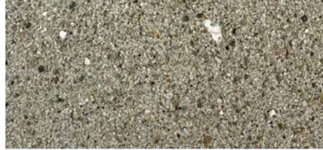
Blue #05 Sandblast Etch (#32-567)