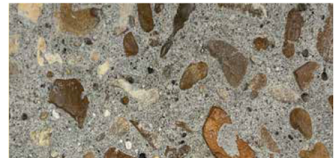
Yellow #15 Up to 1/4" Aggregate (#32-568)