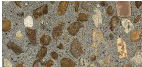
Green #50 1/8" to 3/8" Aggregate (#32-569)