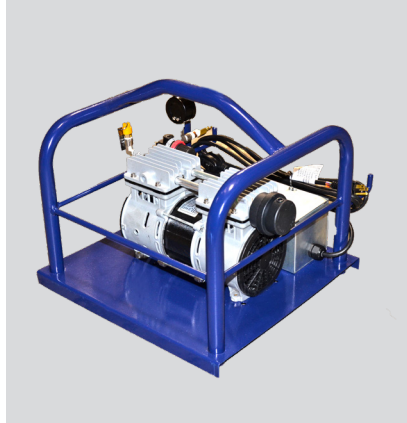
#13-481 Oil-free compressor creates continuous and consistent pressure.