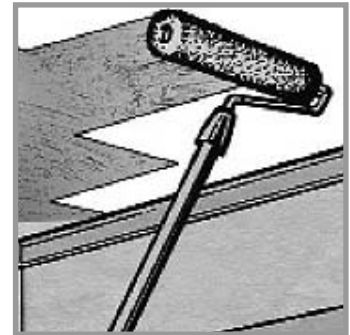
ROLL ON COMPOUND