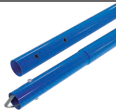
#82-519 (1) Bull Float Tote