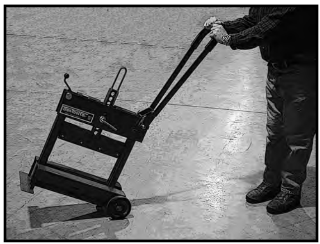
To transport unit, open handle to full open position. Insert support pin through holes at the end of the handle to lock handle in open position.

Place material to be cut in the center of the base. Lower tip blade by turning crank handle clockwise and lower handle until it rests at a 45^{\circ} angle to base.